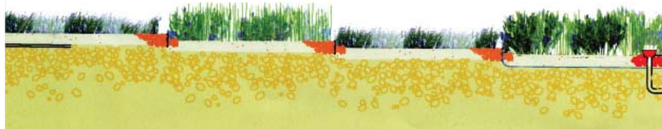
The constructed tiered wetland at the Bronx Zoo conservation center perfectly reflects the institution's mission: habitat preservation and demonstration of environmental conservation.

"The site's hydrology became the genus of the site design, where wet meadows and low-lying wetland plant communities were showcased as a central landscape feature and integral to cleaning and absorbing a natural stream and channeled storm-